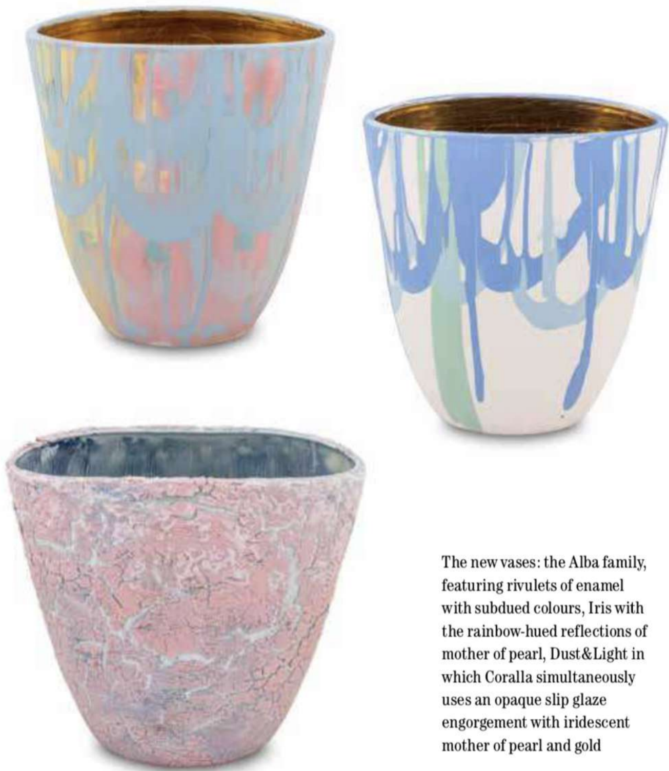
The new vases: the Alba family, featuring rivulets of enamel with subdued colours, Iris with the rainbow-hued reflections of mother of pearl, Dust&Light in which Coralla simultaneously uses an opaque slip glaze engorgement with iridescent mother of pearl and gold